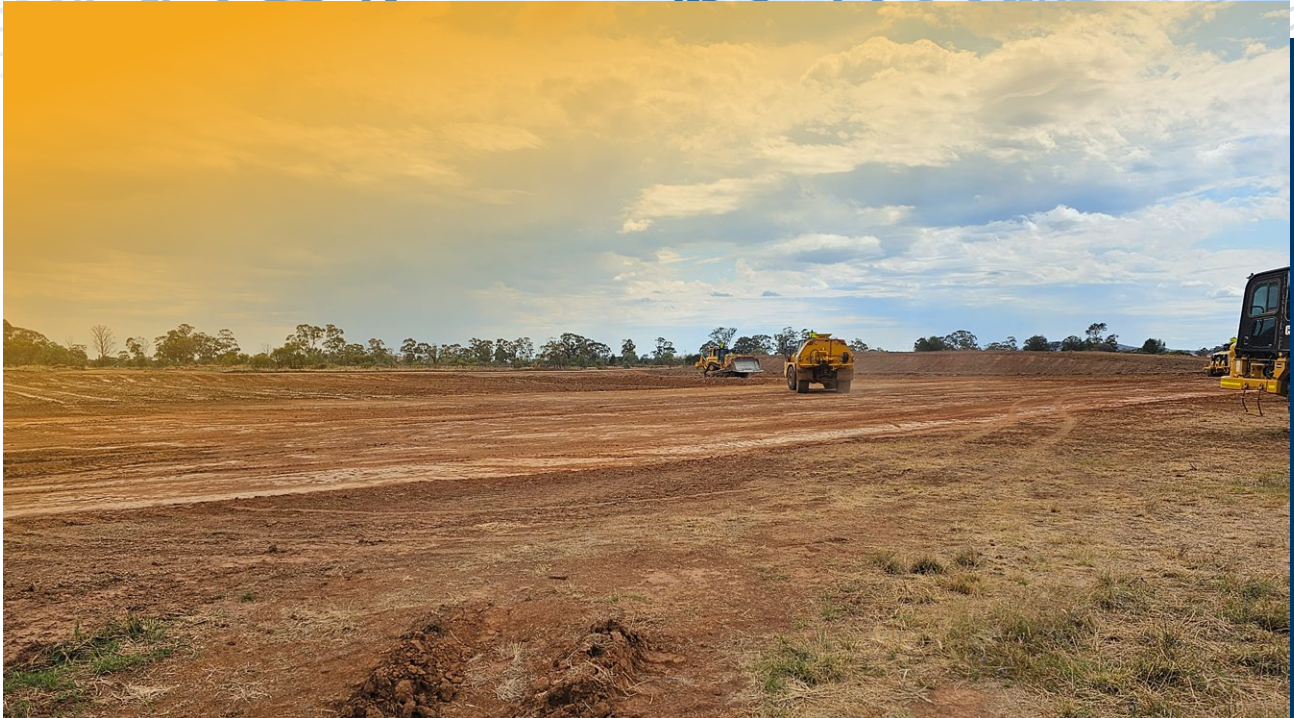
Earthworks at the pastefill plant site, November 2023