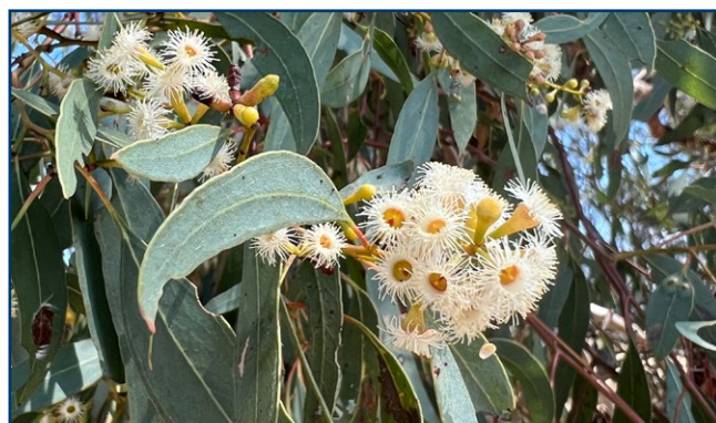
Fuzzy Box ( Eucalyptus conica )