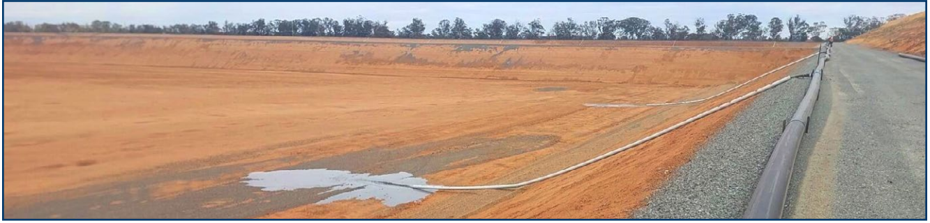
First processing residue RSF2