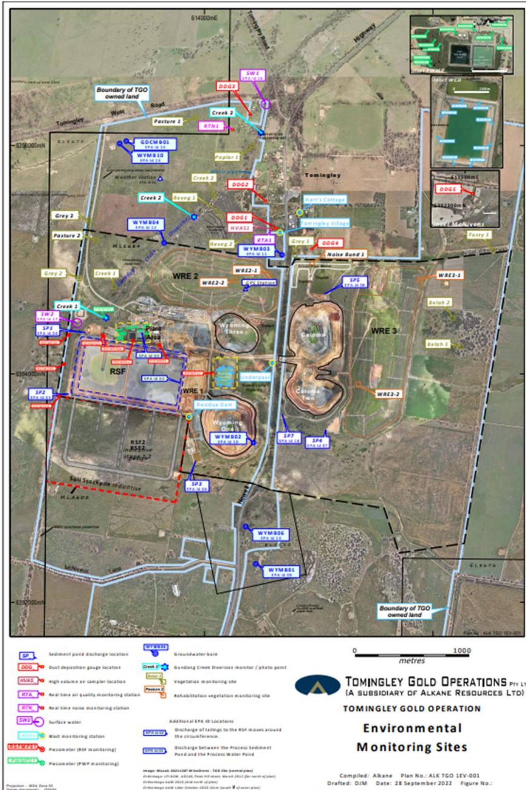
Figure 2. TGO Environmental Monitoring Sites

Figure 2 indicates the location of where monitoring is undertaken for the project. Any additional monitoring undertaken will be discussed within the body of this report.